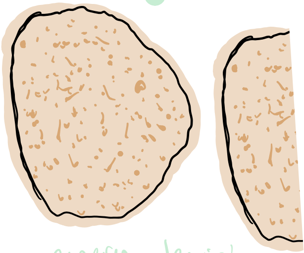
emery - lewis' ticken nuggie + a \frac{1}{2}